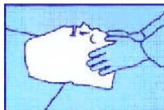
40x30 cm face mask